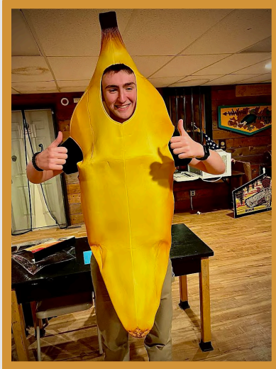
Come to the next event to see our favorite Banana Chief!